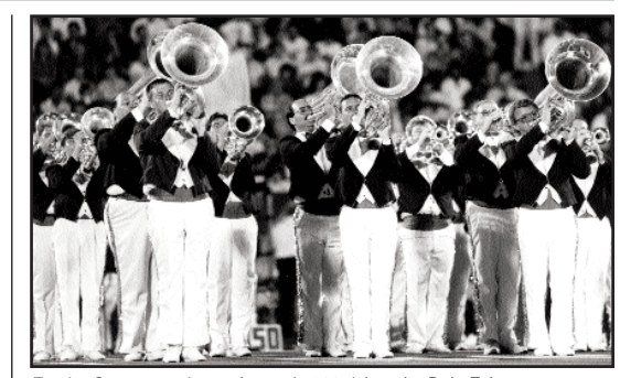
Empire Statesmen (top to bottom) 1988; 1990, 1992.

after eight seasons. The corps fought tooth and nail with both the Hawthorne Caballeros and the Harrison Bushwackers, but came up short by one-tenth of a