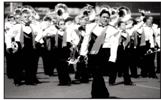
Empire Statesmen, 2002.

say that they have not been entertained by the Statesmen.