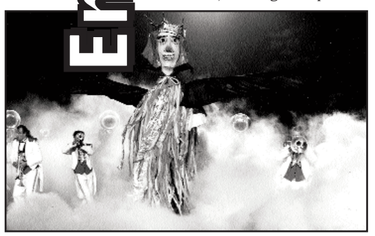
Empire Statesmen, 1993 (photo by Richard Wersinger from the collection of Drum Corps World).

With the beginning of the 1990s, the Statesmen made their first run for the title. They also performed Moonlight Serenade for the last time, retiring the opener