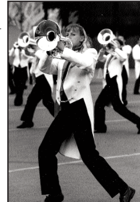
Empire Statesmen, 2001.

Throughout the 20-year history of the Empire Statesmen, members of this unique corps can claim to have set new standards for senior corps, both in competition and entertainment. There are few, if any, fans that can